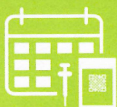
Table 1: Dosage Schedule for Vaccine Pass